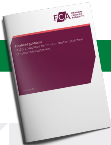
FCA's Finalised Guidance (FG21/1, February 2021)